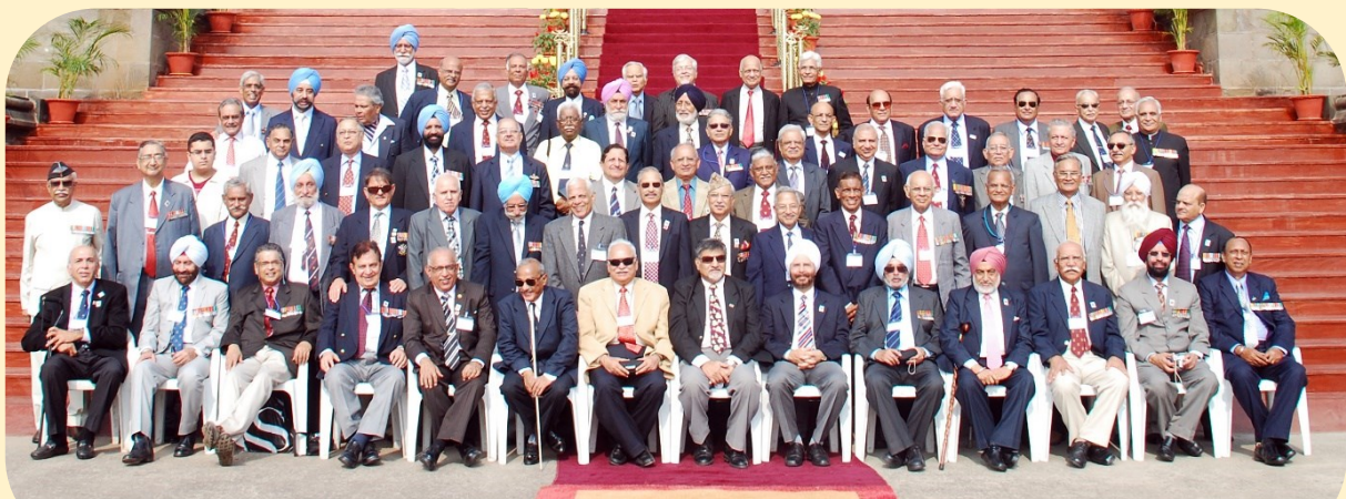
Course Reunion at NDA in 2010.

Website: https://www.ndaglobalnetwork.com/